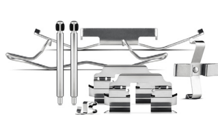
BRAKE ACCESSORY KIT